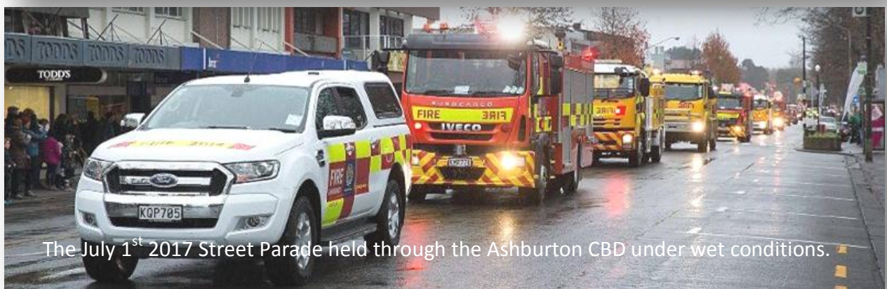
The July 1 st 2017 Street Parade held through the Ashburton CBD under wet conditions.