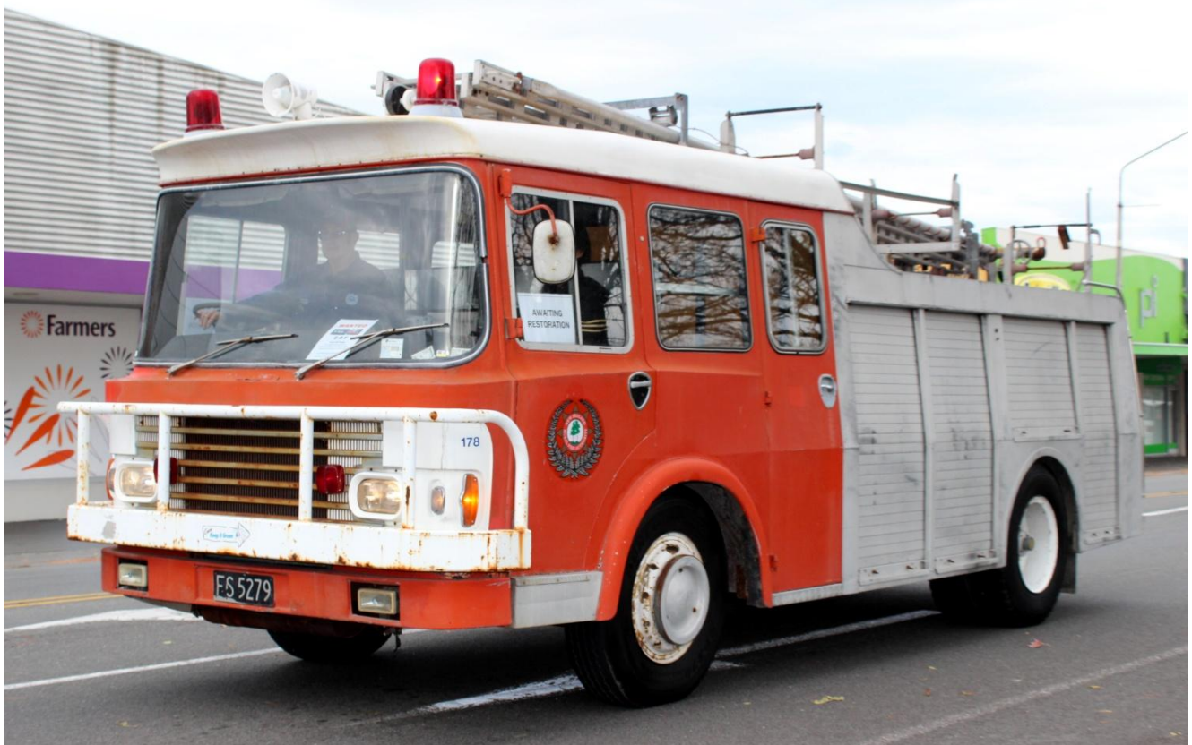
Below: Awaiting restoration with Panelcraft, the 1971 ERF donated by the Fire Services Historical Society nevertheless turned up for the parade.