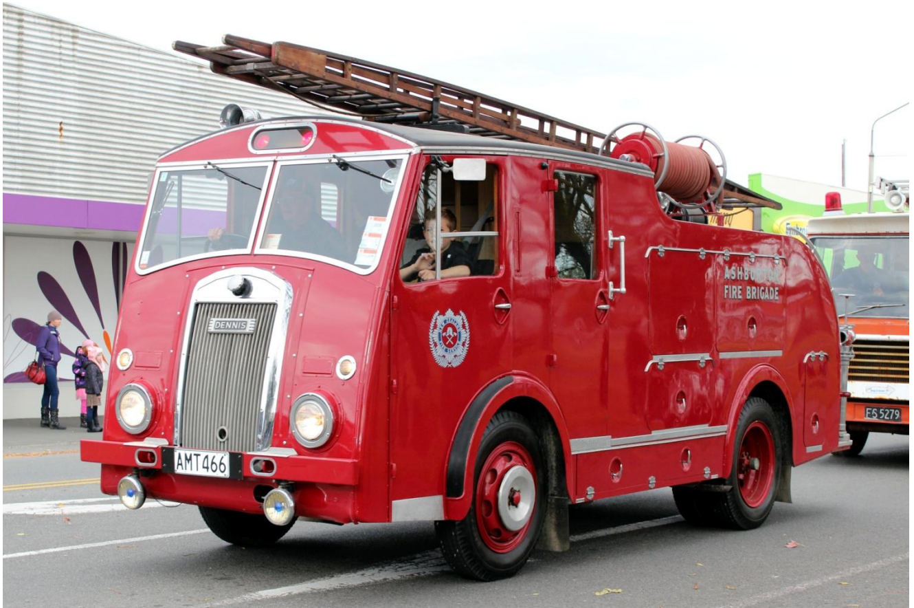
Above: Testimony to Arthur Wolfreys restoration efforts, the F8 still looking very smart.